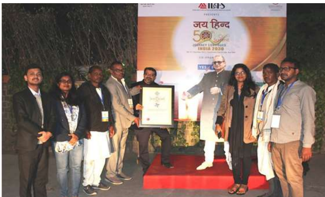
(Group photo of the delegates from Odisha Millets Mission with the Skoch Award 2017)