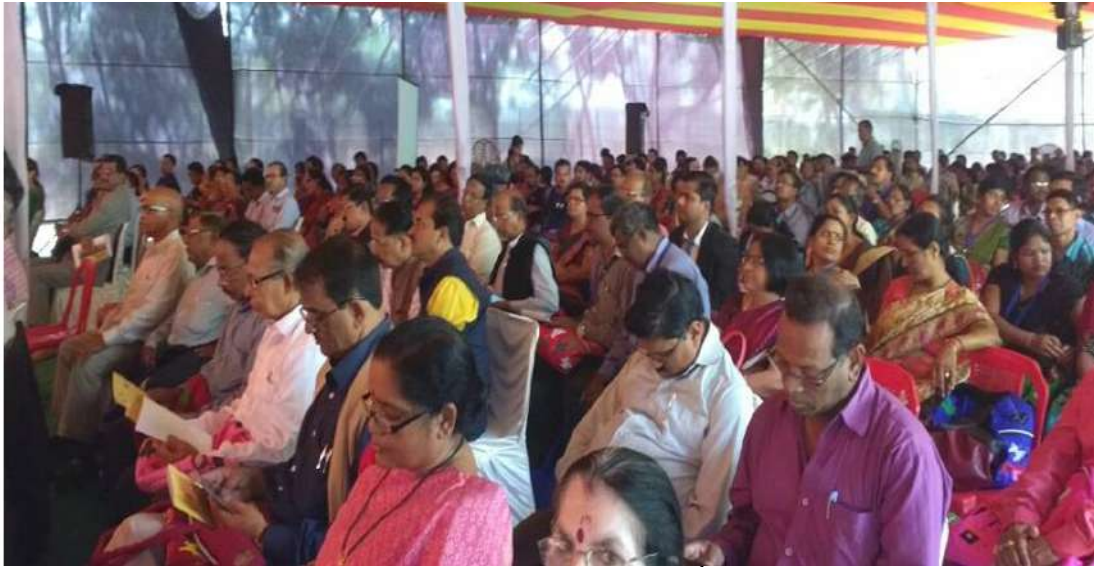
NCDS have a Grand Success to hosting the 50 th Annual Conference (Golden Jubilee) of Odisha Economic Association