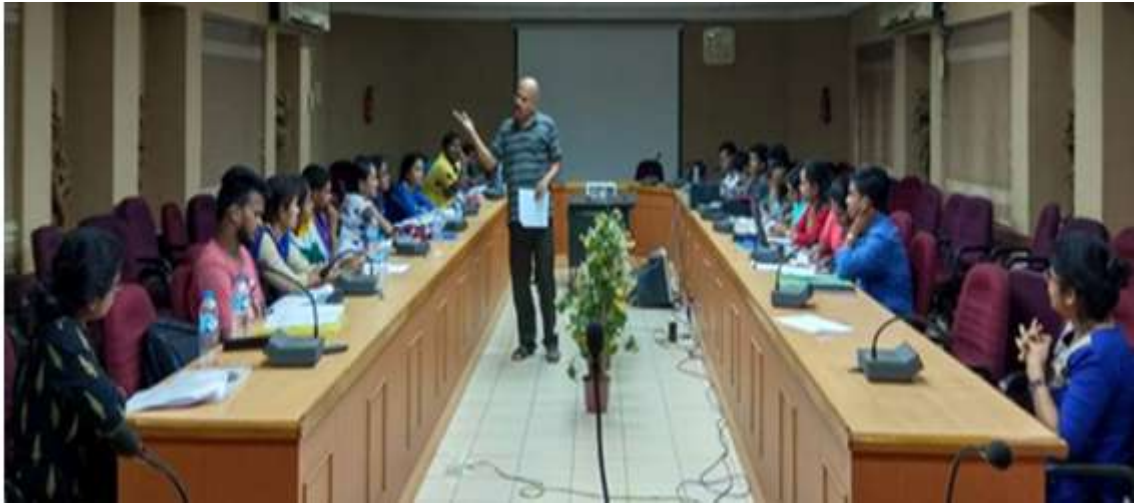
(Orientation Programme of Summer Internship 2018)