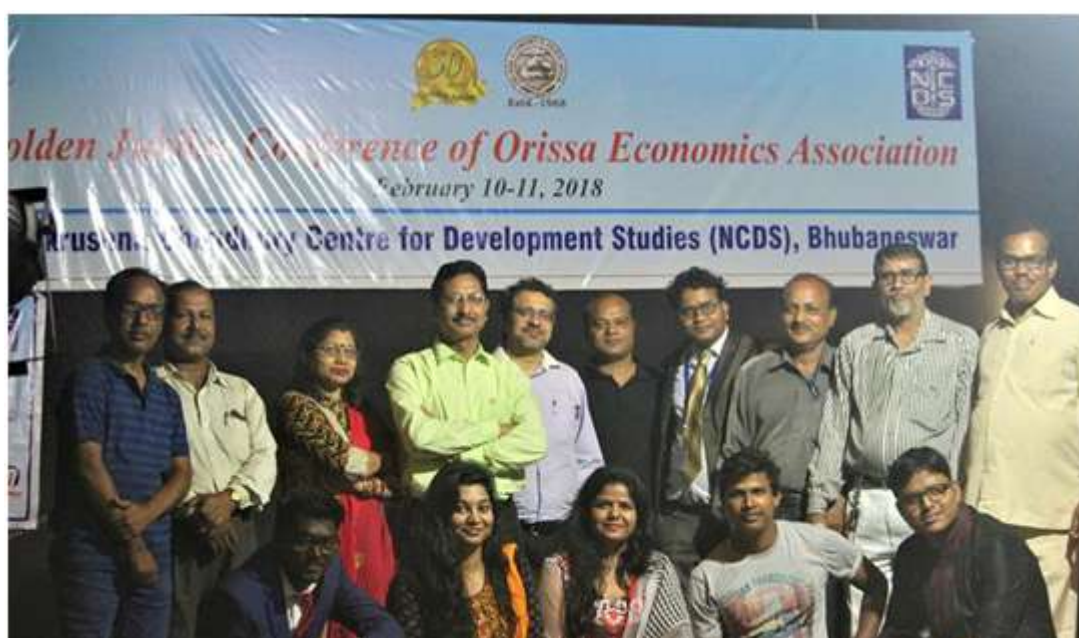
(Team NCDS Cultural Evening at NCDS during Golden Jubilee of Odisha Economic Association)