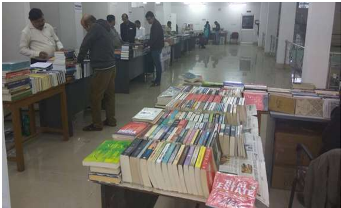
(Annual Book Display Programme of Library for Book Selection)