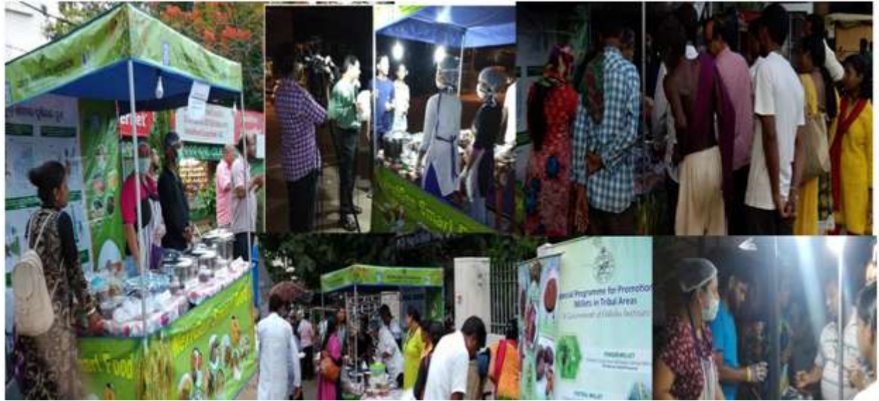
(Smart Food in Smart City: Millet Recipes Stalls in different places of Bhubaneswar by NCDS Urban Interns)