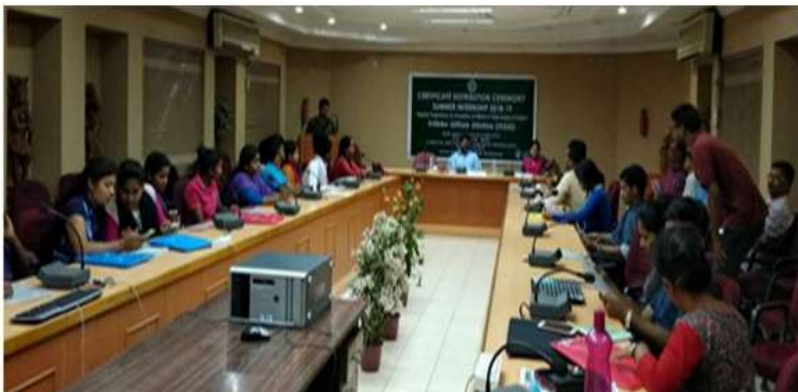
(Certificate Distribution Ceremony of Summer Internship 2018)