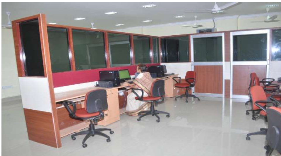
(Census Work Station at NCDS)