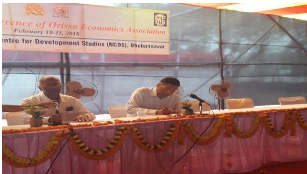
Prof. Arvind Subraman Chief Economic Advisor, GOI, delivering Golden Jubilee Lecture of Orissa Economics Association at NCDS