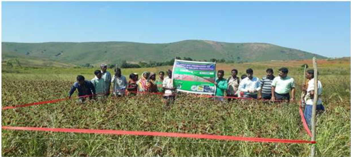
(Crop cutting exercise by Odisha Millets Mission in the Tribal Areas of Odisha)