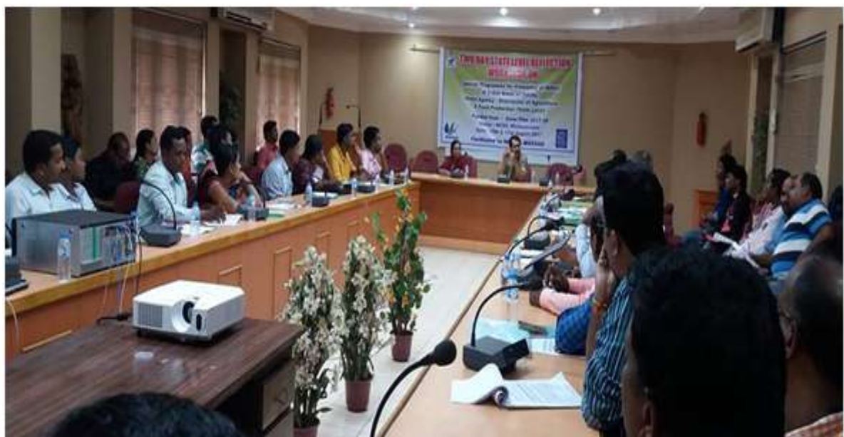
(State Level Reflection Workshop on Special Programme for Promotion of Millets in Tribal Areas of Odisha)