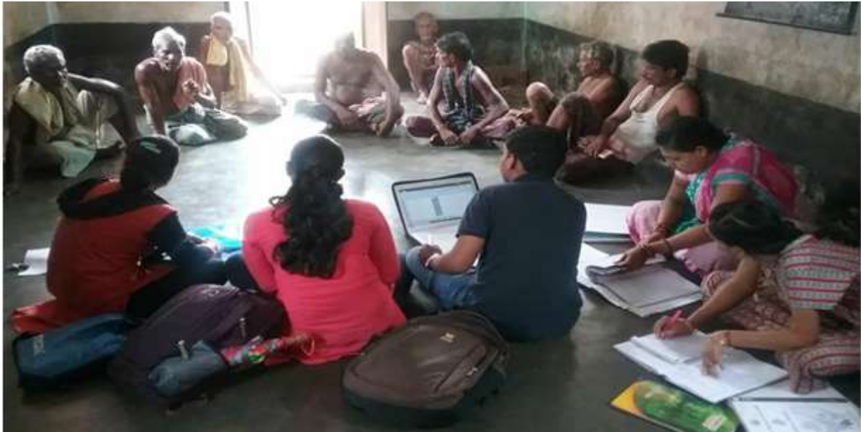
(Data Collection, Community Meeting in Rural Area by NCDS Rural Interns)