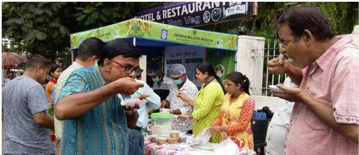
(Millet Recipes Stall near Directorate of Agriculture by NCDS Urban Interns)