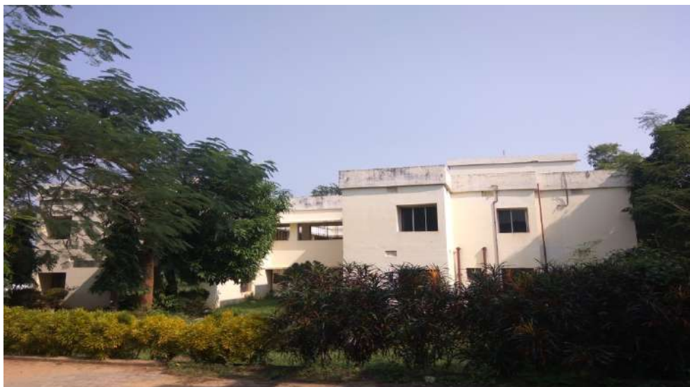
(Hostel-cum-Guest House Building of NCDS)

The Hostel-cum-Guest House is a two storied separate building constructed in the year 1998 with the fund provided by the Indian Council of Social Science Research (ICSSR) and Government of Odisha. It is well equipped with two furnished air-conditioned guest rooms, a Conference Hall, a dining hall and eight rooms. Besides there are two dormitories with seven beds each.