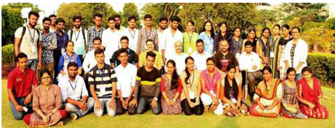
(Group Photo of the summer internship programme 2018)

The Government of Odisha is rolling out a programme on revival of millets in seven districts of southern Odisha. The culmination of this has been a collaborative endeavour by the government, civil society and academia. One of the major objectives of the programme is to increase household consumption, including development of strategies to improve consumption of millets in both urban and rural areas. In this context, the state secretariat (NCDS & WASSAN) launched a millet internship programme in urban areas as well as in rural areas. The primary objective of this is an outreach activity that will initiate students to get a first-hand experience of working with the civil society and academia. This could be the relevance to public policy.