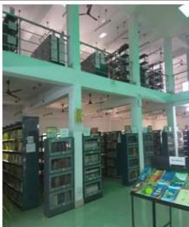
(Inside of the Library)