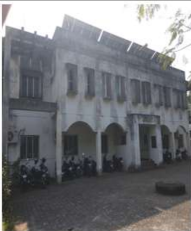
(Outside of the Library Building)

The Centre Library building was inaugurated in the year 2010. The Library has a collection of 17030 volumes of print books, 82 subscribed print journals and more than 30 years periodical back volumes in social sciences. Besides these, PhD Thesis, M. Phil Dissertations, different Reports are also part of the Library's collection. The Library is equipped with AC reading rooms, E-library with computers, internet access points and Wi-Fi connectivity, photocopy and print facility. The Library automation work has been managed by e-Granthalaya software which is developed by National Informatics Centre. The Library has been working with a new initiative for built an Institutional Repository using D-Space. The library is receiving institutional publications (books, journals, magazines etc.) from a number of institutions including different publications of Government of India and Government of Odisha. The library is a Participant of the e-resource Consortium of ICSSR/NASSDOC and avails access to its e-resources. The Library is also a part of Odisha University Consortium to access e-resources provided by ProQuest.