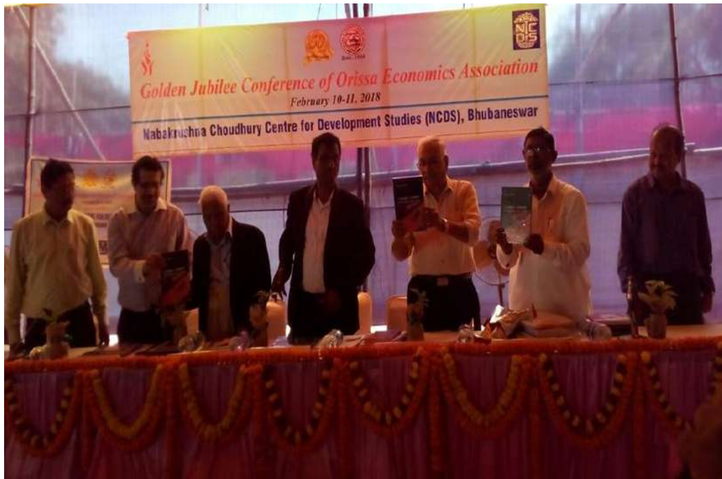
NCDS hosting Golden Jubilee Conference of Orissa Economic Association