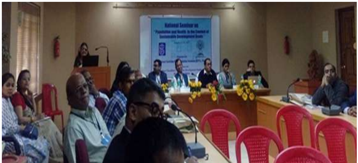
(Seminar on Population and Health in the Context of Sustainable Development Goals)