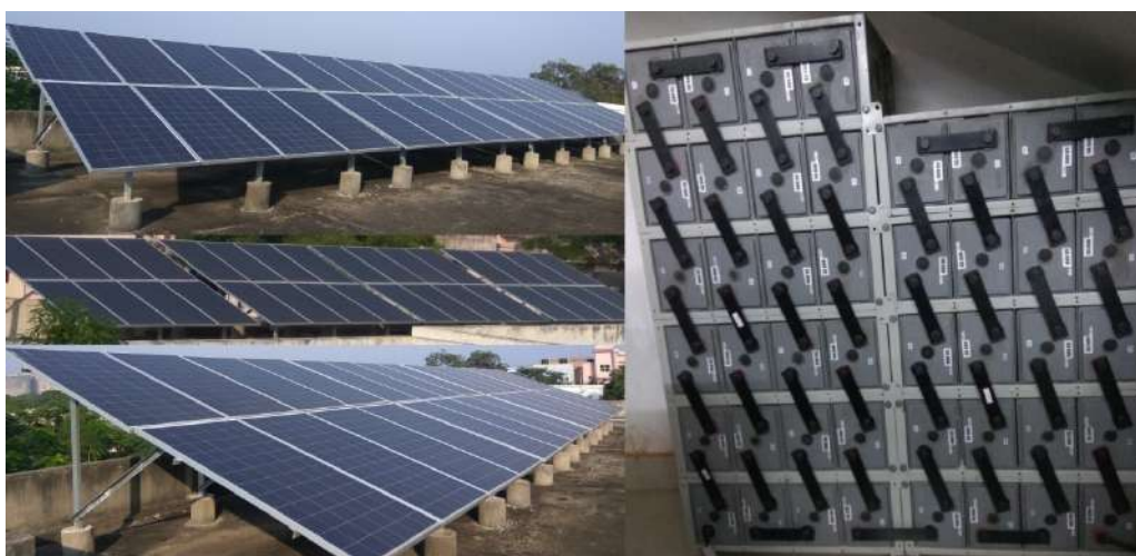
(Solar panels at NCDS)

All the buildings of the institute have been installed with solar panels and water harvesting structures. The solar panels installed in the library and hostel-cum-guest house have started functioning. The solar panels installed in the administrative building have to be integrated to the grid system.