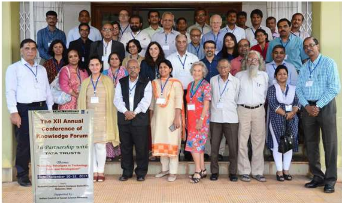
(Group Photo of the Indian and foreign delegates during The XII Annual Conference of Knowledge Forum)