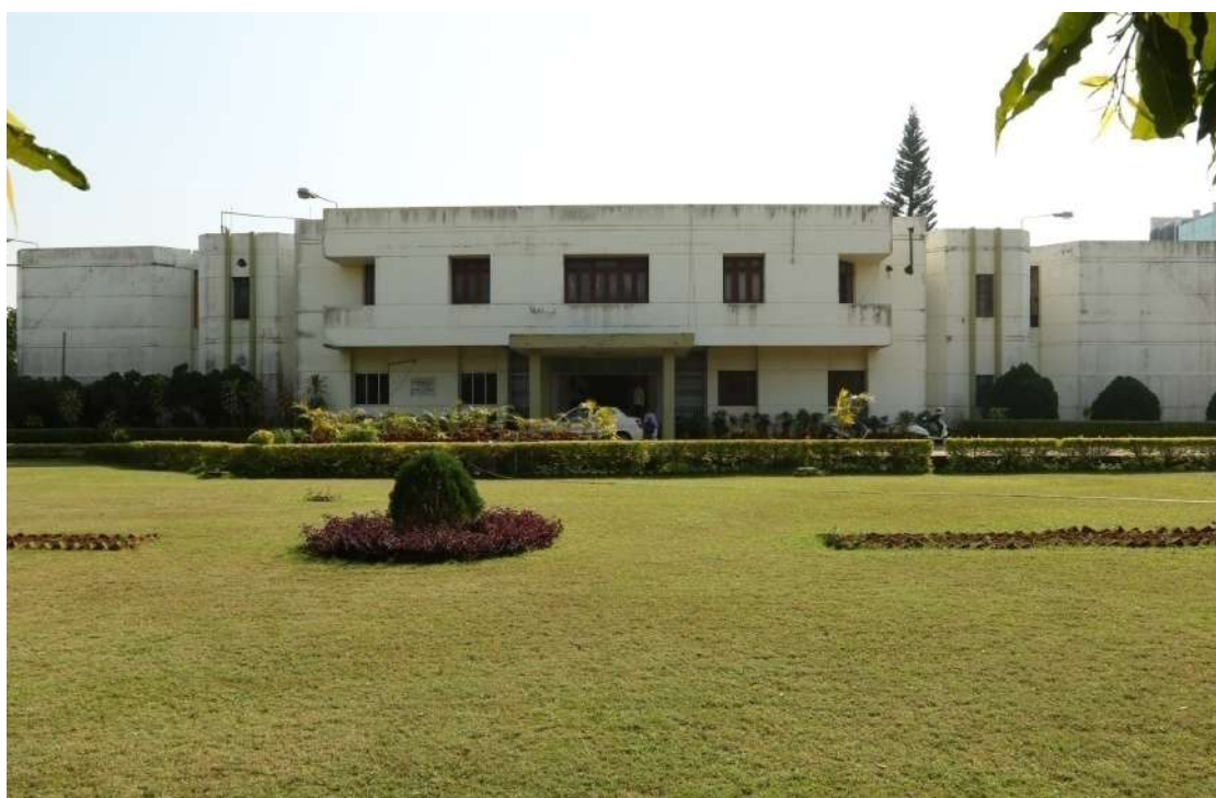
(Administrative & Academic Building of NCDS)

NCDS is reasonably well equipped with all necessary infrastructure and services for undertaking development related applied and theoretical research in social sciences. It has a common computer pool with 12 computers for use of the research scholars and project staffs. The Centre's computer facilities consist of 26 Nos. Of PCs, 3 Laptops, 12 Laser Printers, two colour laser printers, two multi functionaries, five dot matrix printers and one Xerox work Centre. It has two photo copiers, one laser colour printer, and two scanner-fax-printers. The faculty, supporting research staff and the research scholars are provided with unlimited access to Internet facility and personal computers through LAN system. Software package for statistical applications like SPSS have been installed to facilitate research. The NCDS Campus is fully Wi-Fi confluent.