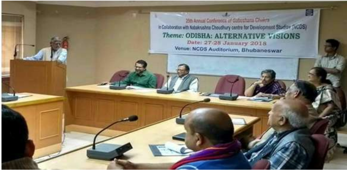
(25th Annual Conference of Odisha Ganesha Chakra at NCDS Bhubaneswar)