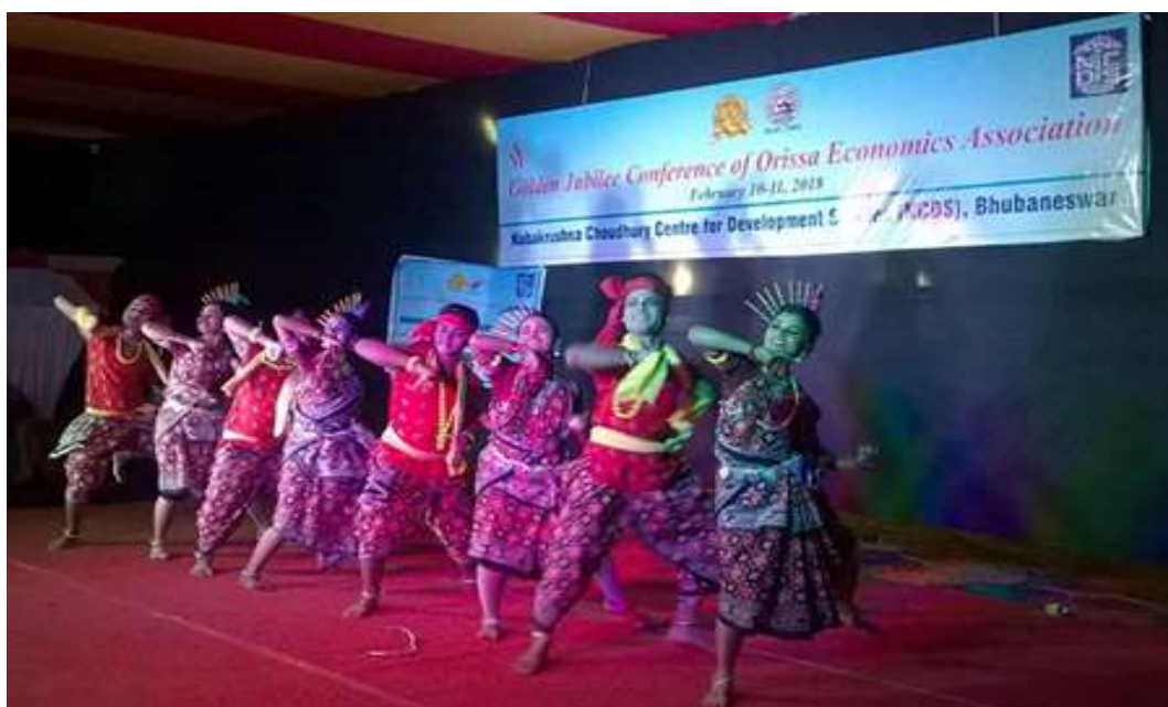
(Cultural Evening at NCDS during Golden Jubilee of Odisha Economic Association)